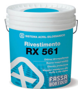
RX 561 Rustic acrylic siloxane top coat