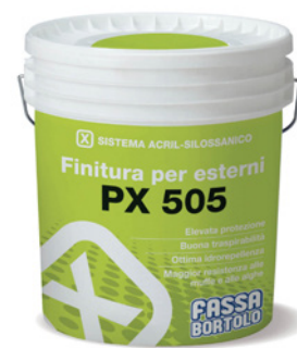
PX 505 Acrylic-siloxane filling finish