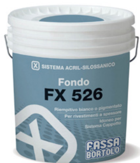
FX 526 Alkali-resistant fibreglass reinforcing mesh, 160 g/m 2