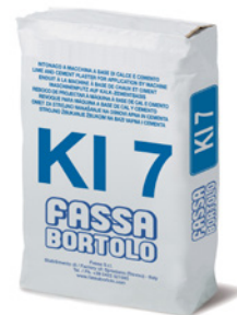
KI 7 Fibre reinforced lime/cement base coat plaster with water-repellent properties, for exteriors and interiors