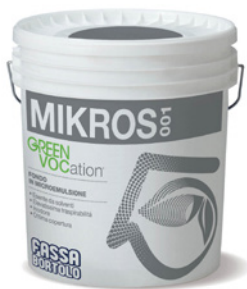
MIKROS 001 Wall primer in water microemulsion