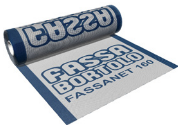
FASSANET 160 Alkali-resistant fibreglass reinforcing mesh, 160 g/m 2