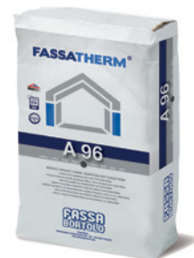
A 96 Grey and white fibre-reinforced cement adhesive-skin coat for Fassatherm® systems