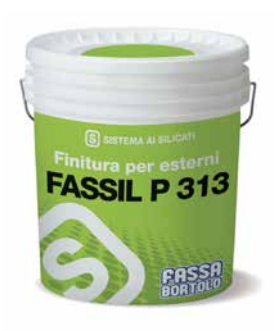
FASSIL P 313 Smooth water-based silicate mineral paint