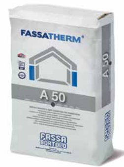
A 50 White and grey cementitious building adhesive