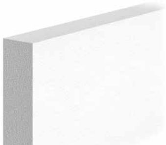
EPS 120 THERMAL INSULATION PANEL EPS 120 thermal insulation panel