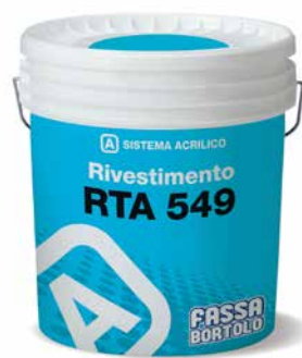
RTA 549 Acrylic coating suitable for thermally-insulated surfaces